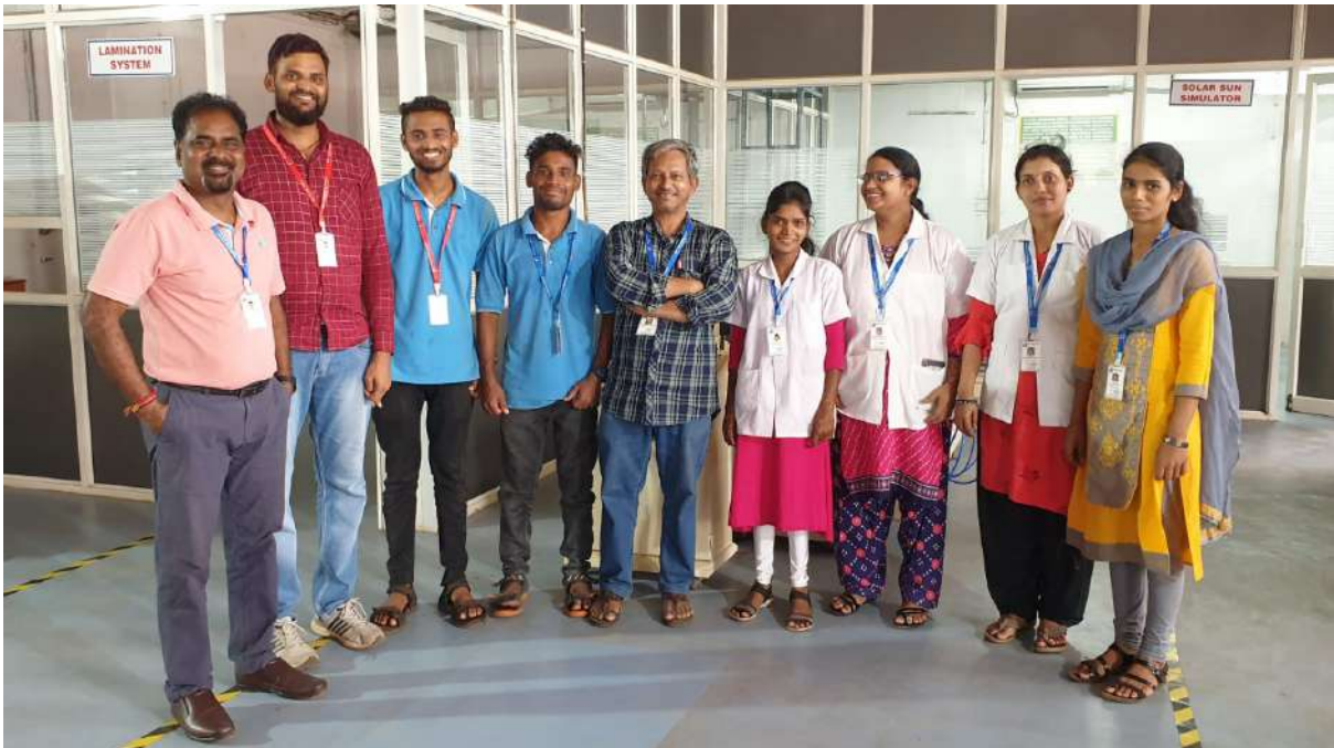
Team members and staff