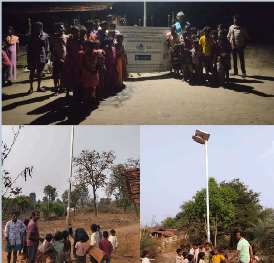
Samaritans For the Nation - Bhadradi Kothagudem