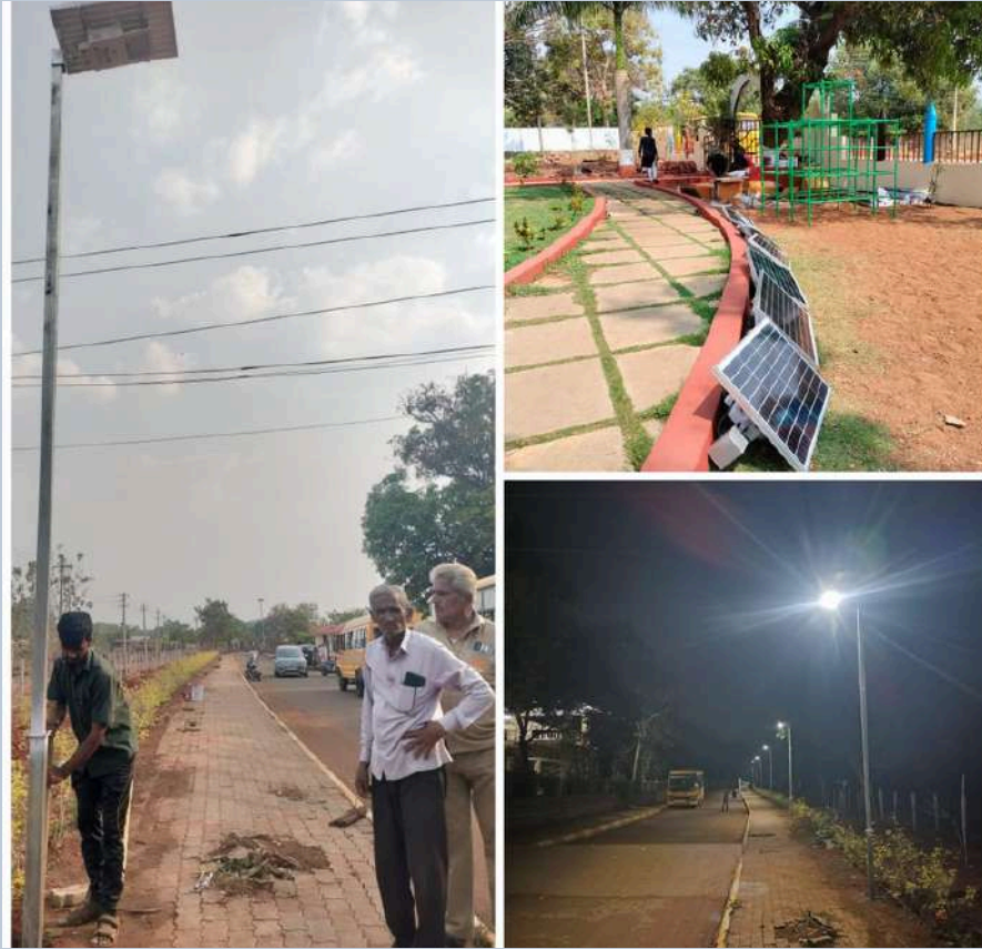
Manik Public School - Manik Nagar, Humnabad, Bidar (Karnataka)