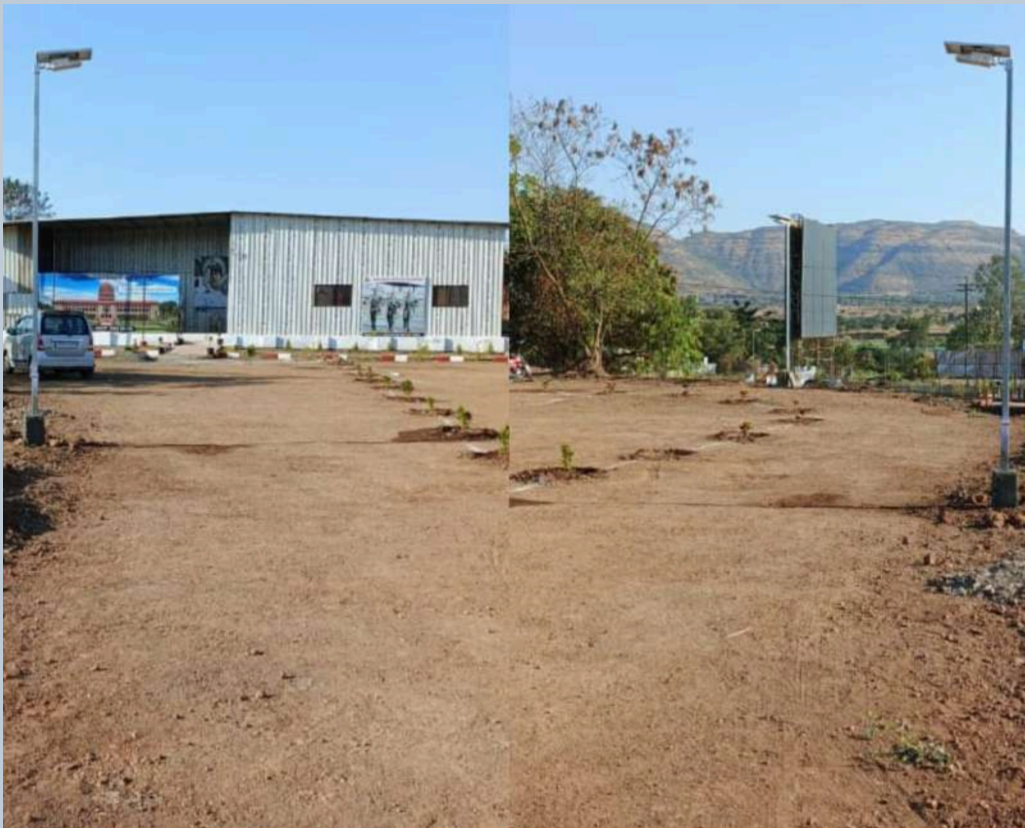
Jaguars Academy – Nashik